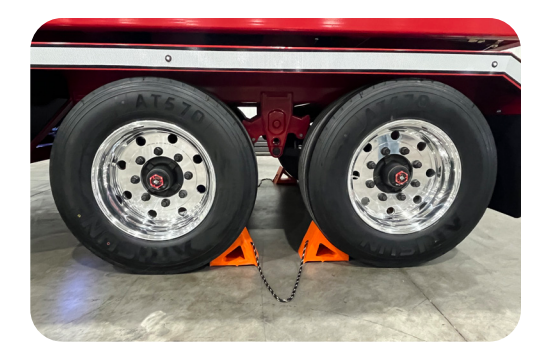
TIRES ✓ 445-50 R 22.5 20PLY tires ✓ Twin 20k rated axles with trailer brakes