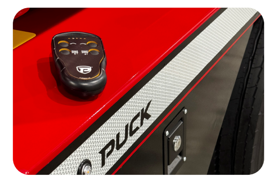
PRECISION CONTROL ✓ Wireless reel control via handheld remote ✓ Manual secondary controls standard

LIGHTING PACKAGE LED scene and emergency lights Zone controlled scene and work lights