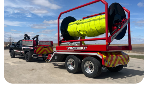
REEL CAPACITY ✓ Holds up to 2,500' of 8" layflat hose ✓ 105° reel articulation maximizes loading capacity