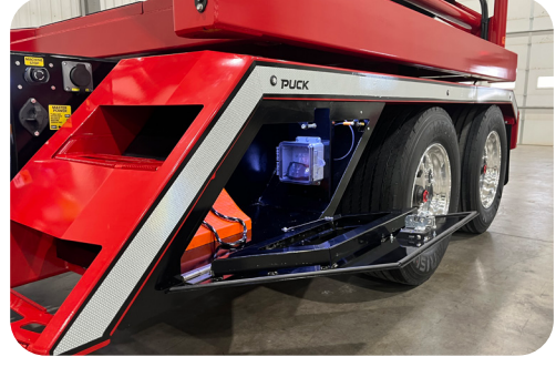
ON-BOARD STORAGE ✓ Dedicated remote control storage enclosure ✓ Illuminated for visibility