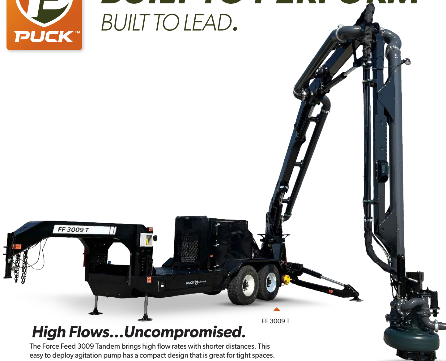
FF 3009 T