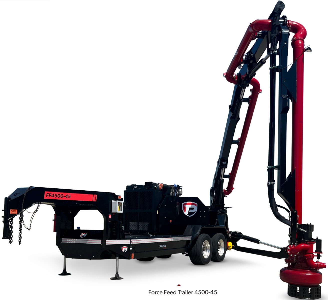
Force Feed Trailer 4500-45

A New Approach to Bringing Water to the Fire