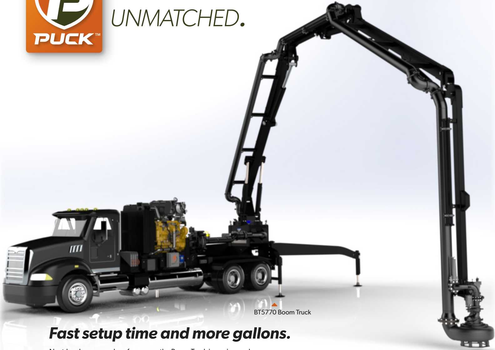
BT5770 Boom Truck