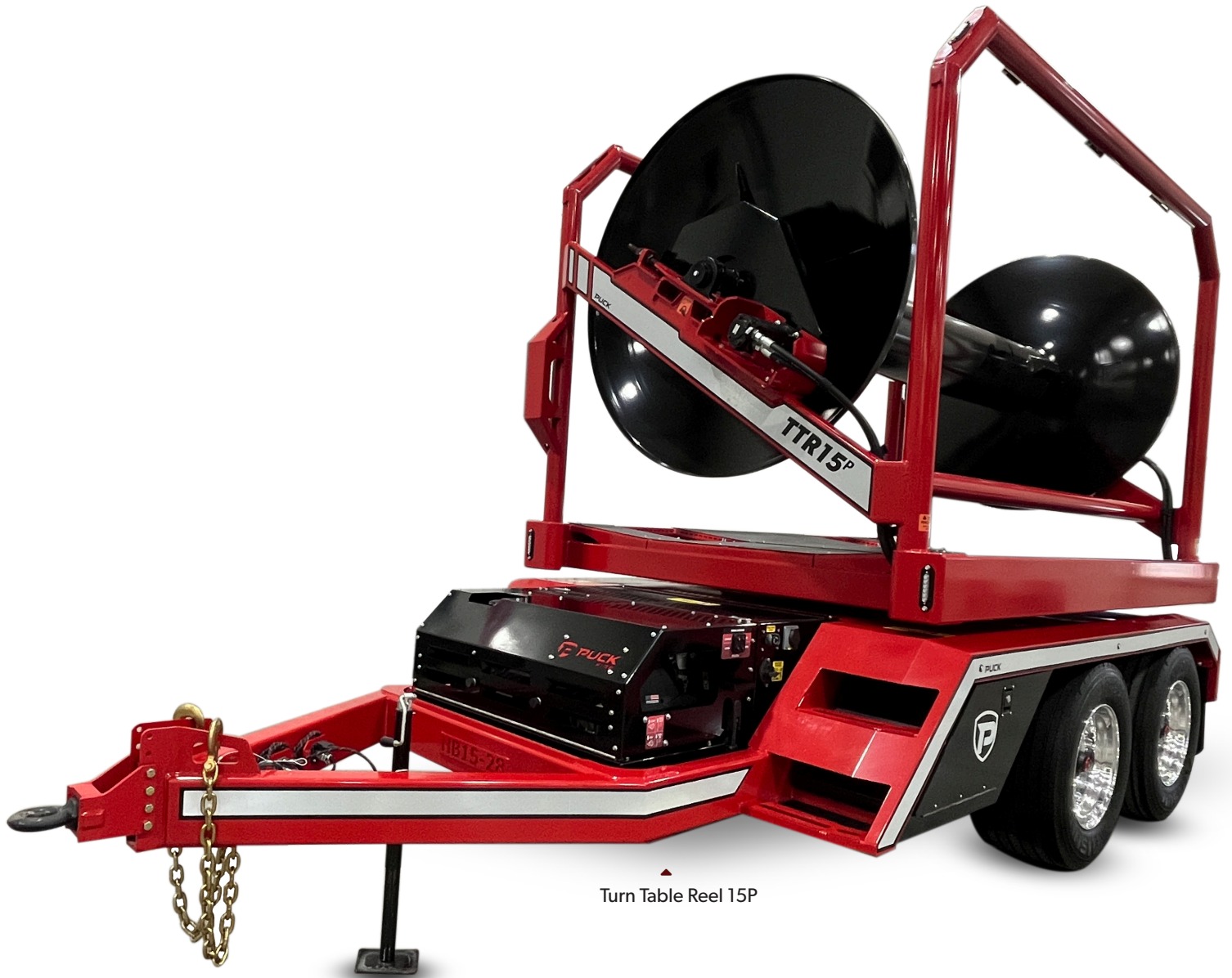
Turn Table Reel 15P

A New Approach to Bringing Water to the Fire