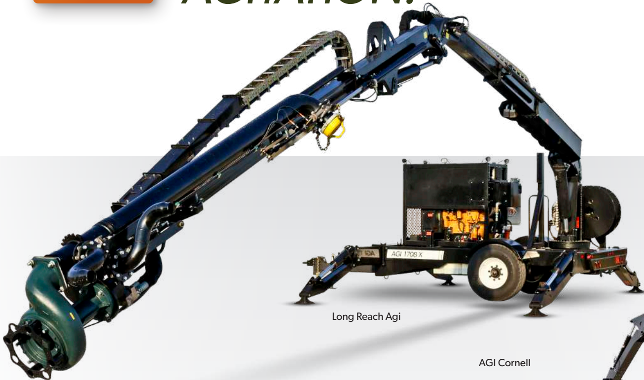
Long Reach Agi