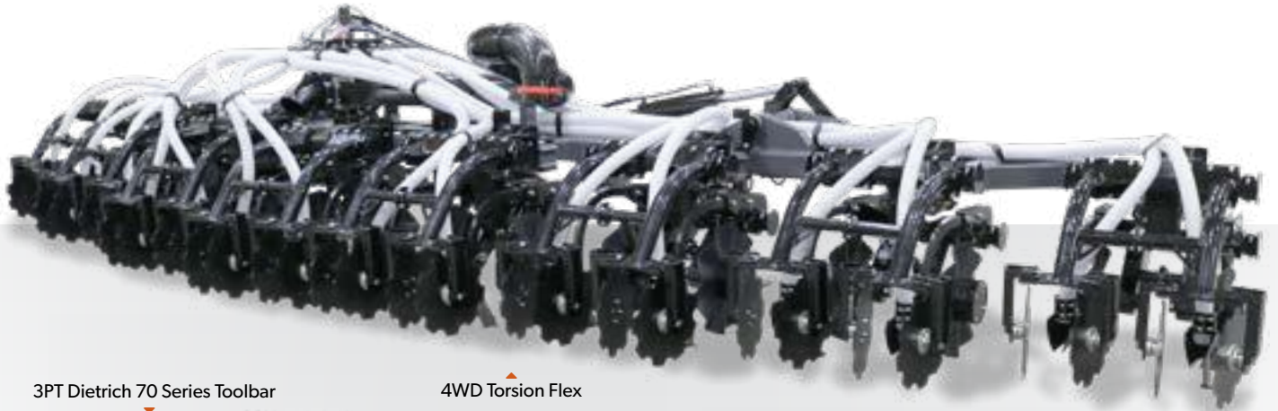
3PT Dietrich 70 Series Toolbar