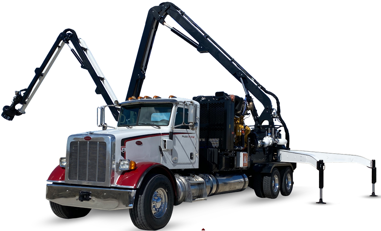
Force Feed Truck 4000-70

A New Approach to Bringing Water to the Fire